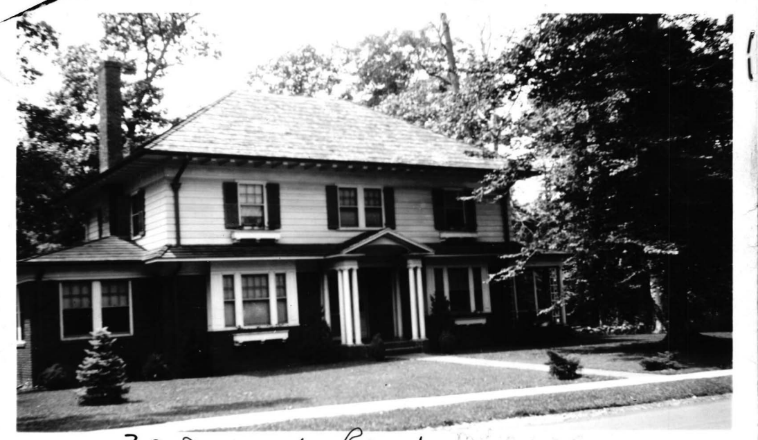
20 Durand Road